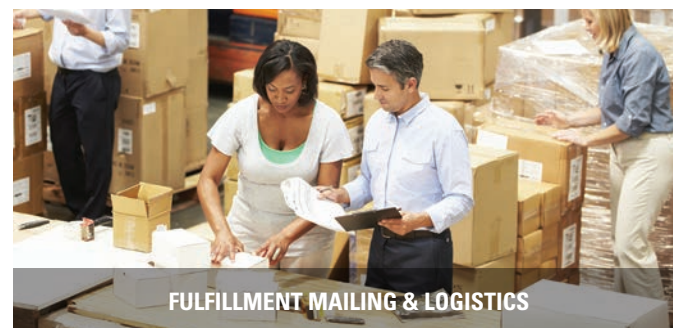
FULFILLMENT MAILING & LOGISTICS