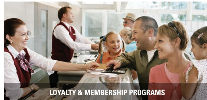
LOYALTY & MEMBERSHIP PROGRAMS

1•2•1MSG Loyalty & Membership Program Solutions