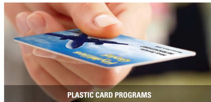
PLASTIC CARD PROGRAMS

1•2•1MSG Loyalty & Membership Program Solutions